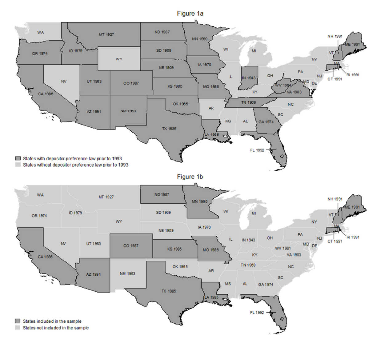
Figure 1 Development of state depositor preference laws in the U.S.